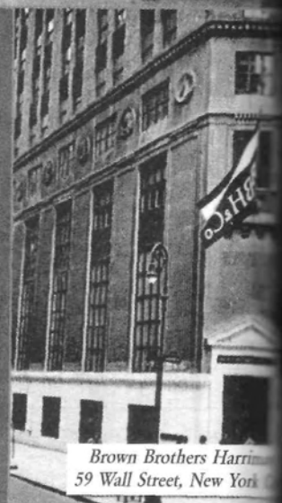
Brown Brothers Harriman 59 Wall Street, New York