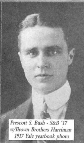
Prescott S. Bush - S&B '17 w/Brown Brothers Harriman 1917 Yale yearbook photo