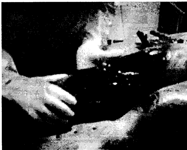
Figure 4 From the Footage.

Close up side view of alleged alien. In the background the telephone can be seen on the wall plus various instruments and receptacles.