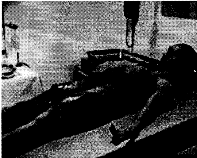
Figure 2 From the Footage.

BUFORA is taking a pragmatic approach and is keeping an open, objective mind regarding the validity of the Santilli claims. But the Association is committed to completing a comprehensive and unbiased examination of this new evidence. Fact or fiction, BUFORA will fully report its findings.