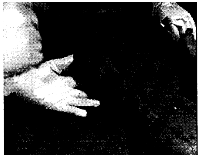
Figure 5 From the Footage.

Close up of damaged leg. Leg is being held by one of those taking part in the autopsy.