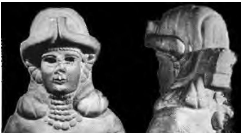
NANA. Syria. 2300 B.C.

For instance, before the Syrian goddess NANA (c. 2300 BC) entered the passageway to the underworld she decked herself out in a garment called her PALA or “miracle garment” that healed her body. Her snugly fitting Shugurra helmet, says the myth, took her far into the universe. The blue stones at her neck caused enlightenment.