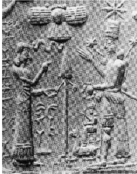
NANA with her pillar and serpent. Iraq. 1050 B.C.

NANA put on this garment when interacting with her pillar or axis that reached into heaven. Her husband, a serpent, dwelled within the pillar.