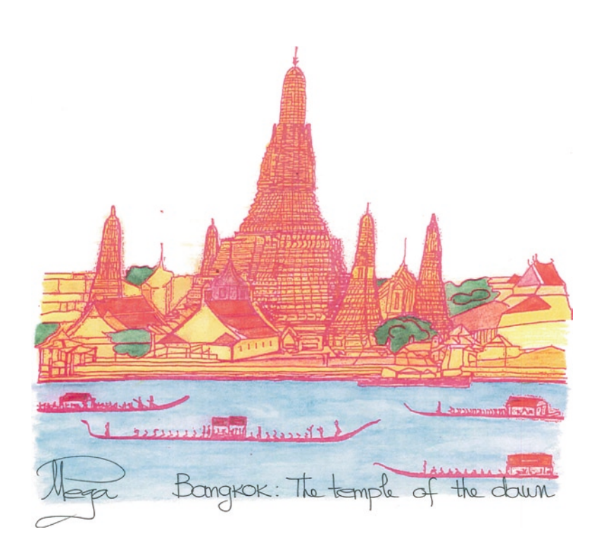
Watercolour 12: Bangkok: The Temple of the Dawn