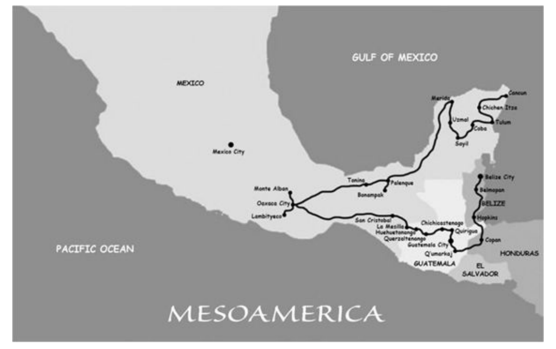
Typical travel itinerary by the author.