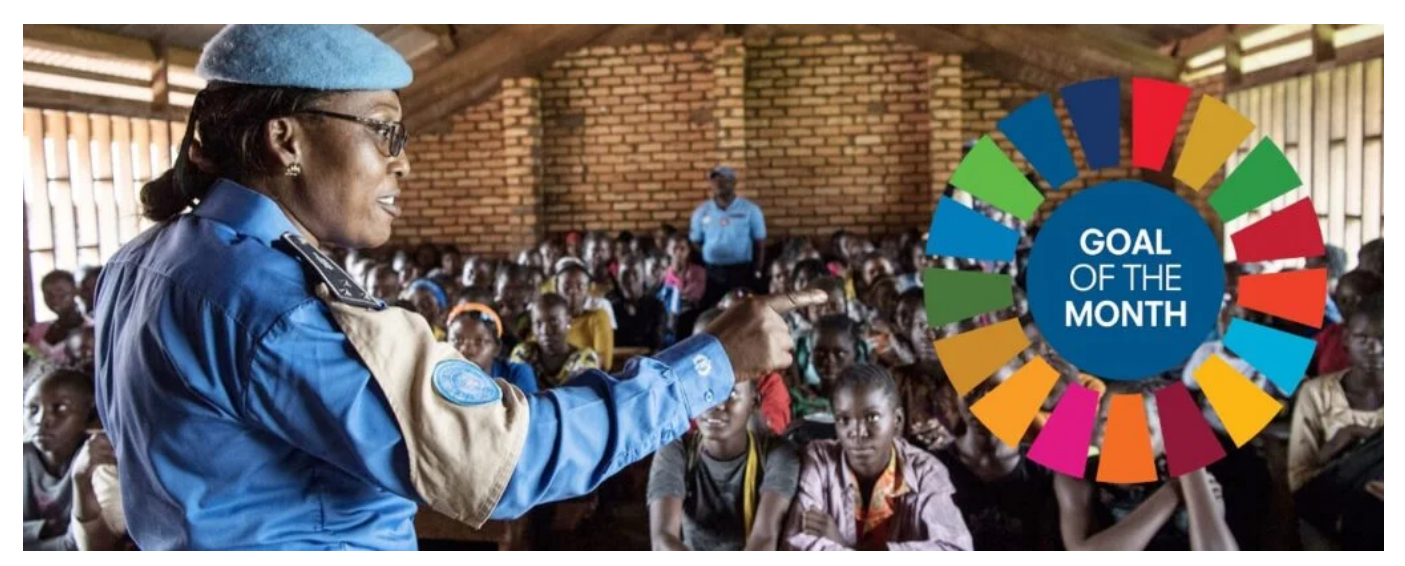
The UN educates young people in developing nations to welcome "Sustainable Development" without disclosing the impact it will have on their lives or their national economy

Most people are aware of the concept of "Sustainable Development" but, it is fair to say that the majority believe that SDGs are related to tackling problems allegedly wrought by <u>climate disaster</u>. However, the Agenda 2030 SDGs encompass every facet of our lives and only one, SDG 13, deals explicitly with climate.