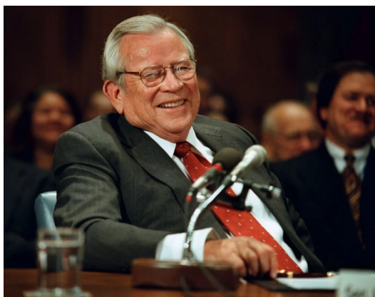
Senator Howard Baker (R-TN)