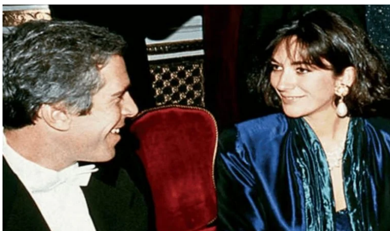
Ghislaine and Jeffrey Epstein at a 1991 memorial event for her father at the Plaza Hotel

It later emerged that during this period and the years that followed, Ghislaine had shifted from being dependent on her father to being “entirely dependent” on Jeffrey Epstein for her “ lavish lifestyle .” Some acquaintances of Ghislaine have since claimed that “she started working for him [Epstein] immediately after her father died.”