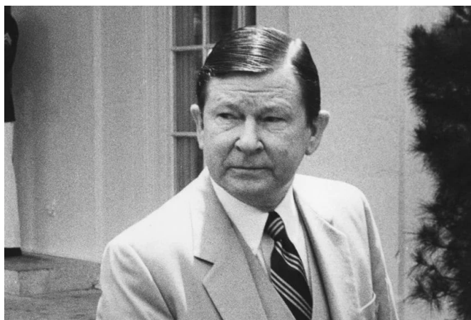
Senator John Tower (R-TX)