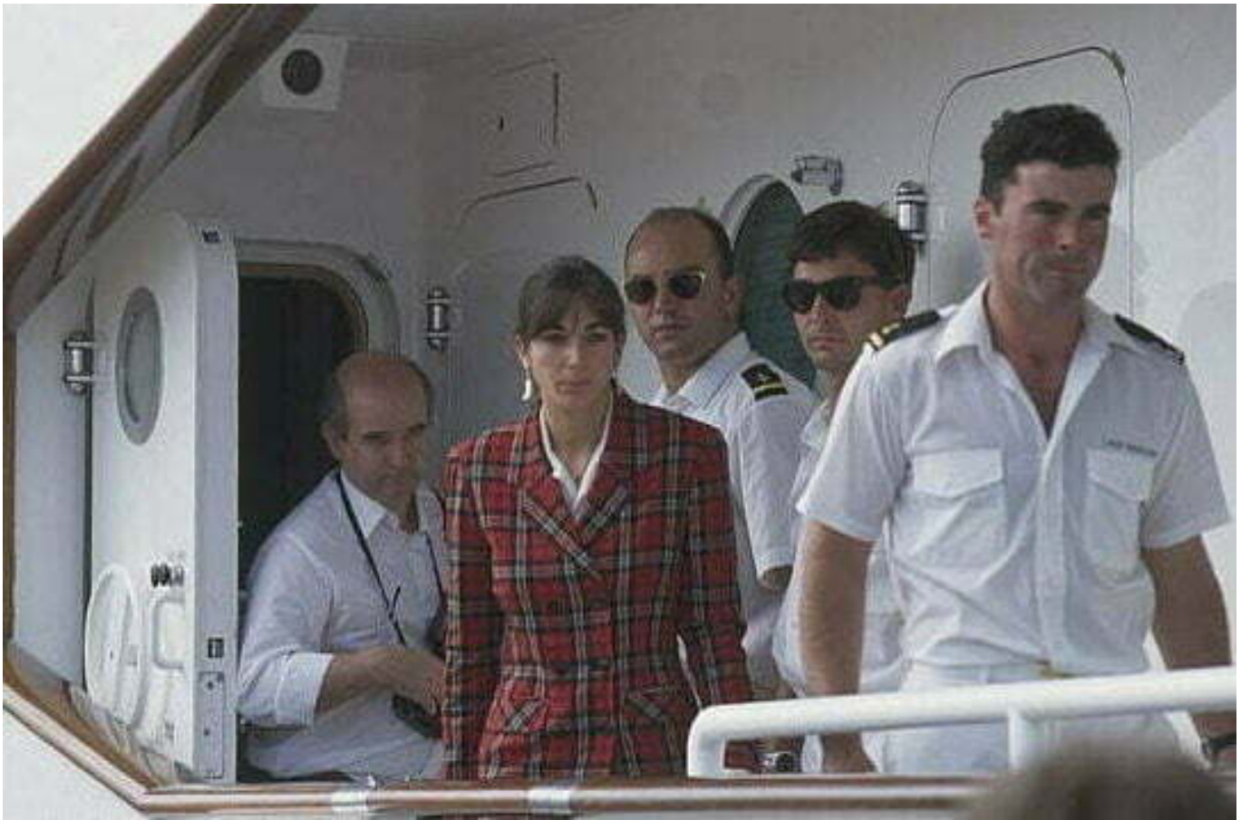
Ghislaine aboard the Lady Ghislaine shortly after her father's death

Following her father's death, Ghislaine publicly claimed to know next to nothing of his affairs and to have no money herself, despite it being well known that her father had created numerous trusts in the Lichtenstein tax haven that were meant to fund the Maxwell family for "generations." A New York detective who interviewed Ghislaine in Manhattan while trying to trace her father's assets later stated: