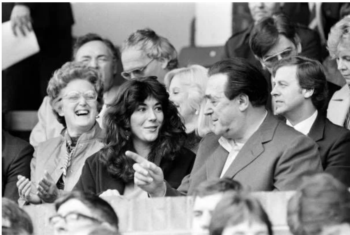
Ghislaine and her father at an Oxford United football match

In much the same way as Ghislaine's young personal life was controlled by her father, her entry into the working world after her graduation from Oxford was directly facilitated and managed by her father, with Robert Maxwell setting her up "with a string of jobs across his business empire." By 1984, at age twenty-two, she was serving as a director of the British football club Oxford United alongside her brother Kevin. At the time, Robert Maxwell held shares in the club through a company created explicitly for that purpose. He served as the club's chairman beginning in 1982.