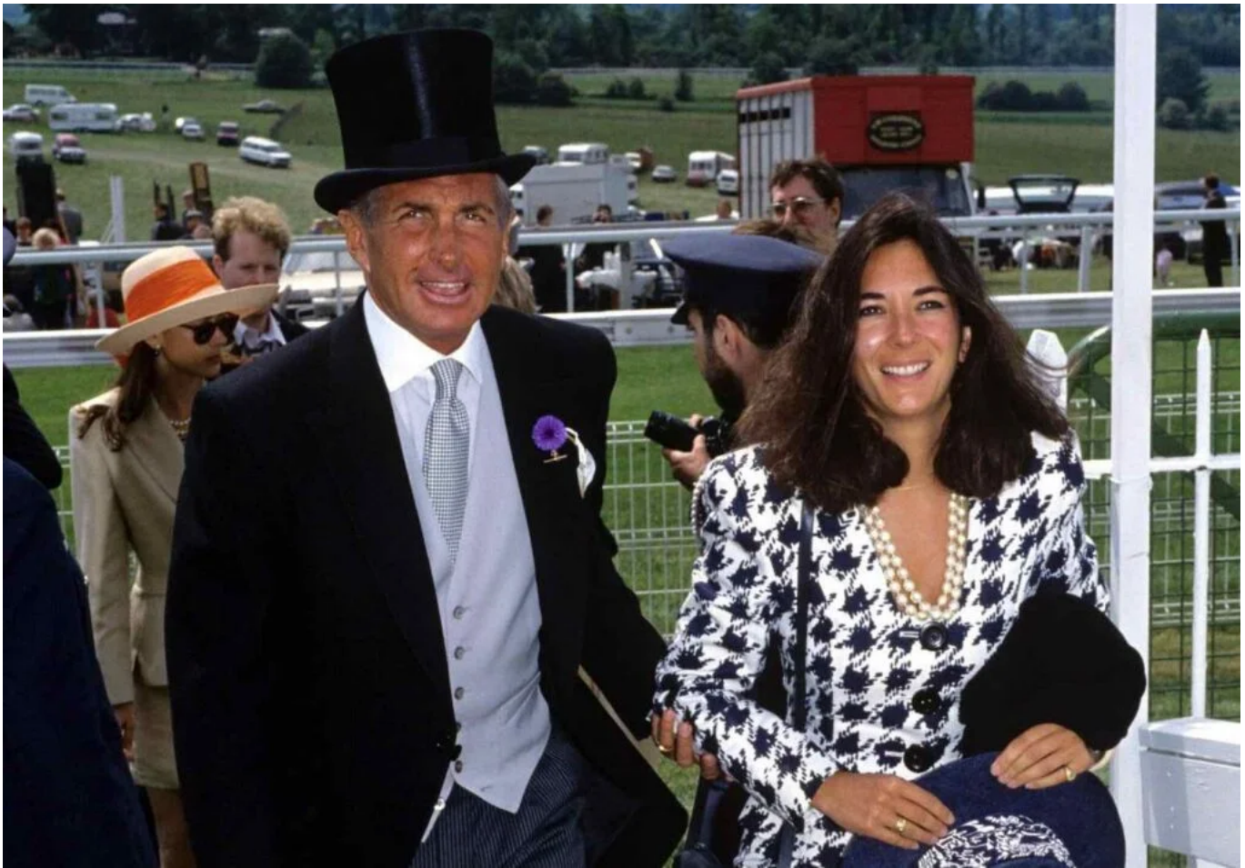
George Hamilton and Ghislaine Maxwell attend the Epsom races in 1991

A NY prosecutor referred to Hamilton as a “front” for Marcos, and media reports at the time claimed he had also acted as Imelda Marcos’s financial adviser. The Associated Press reported that Hamilton had been an unindicted co-conspirator in the fraud and racketeering cases brought against Imelda Marcos after she and her husband fled their country in 1986. The congressional committee tasked with investigating the flight of billions from the Philippines just prior to Marcos’s ouster declined to investigate the financial transactions surrounding Hamilton, which were alleged to have been connected to that very crime. Notably, at the same time, the CIA refused to disclose what it knew about the capital flight. As mentioned later in this article, the private investigator hired by this congressional committee to track down the Marcos’s money was Jules Kroll.