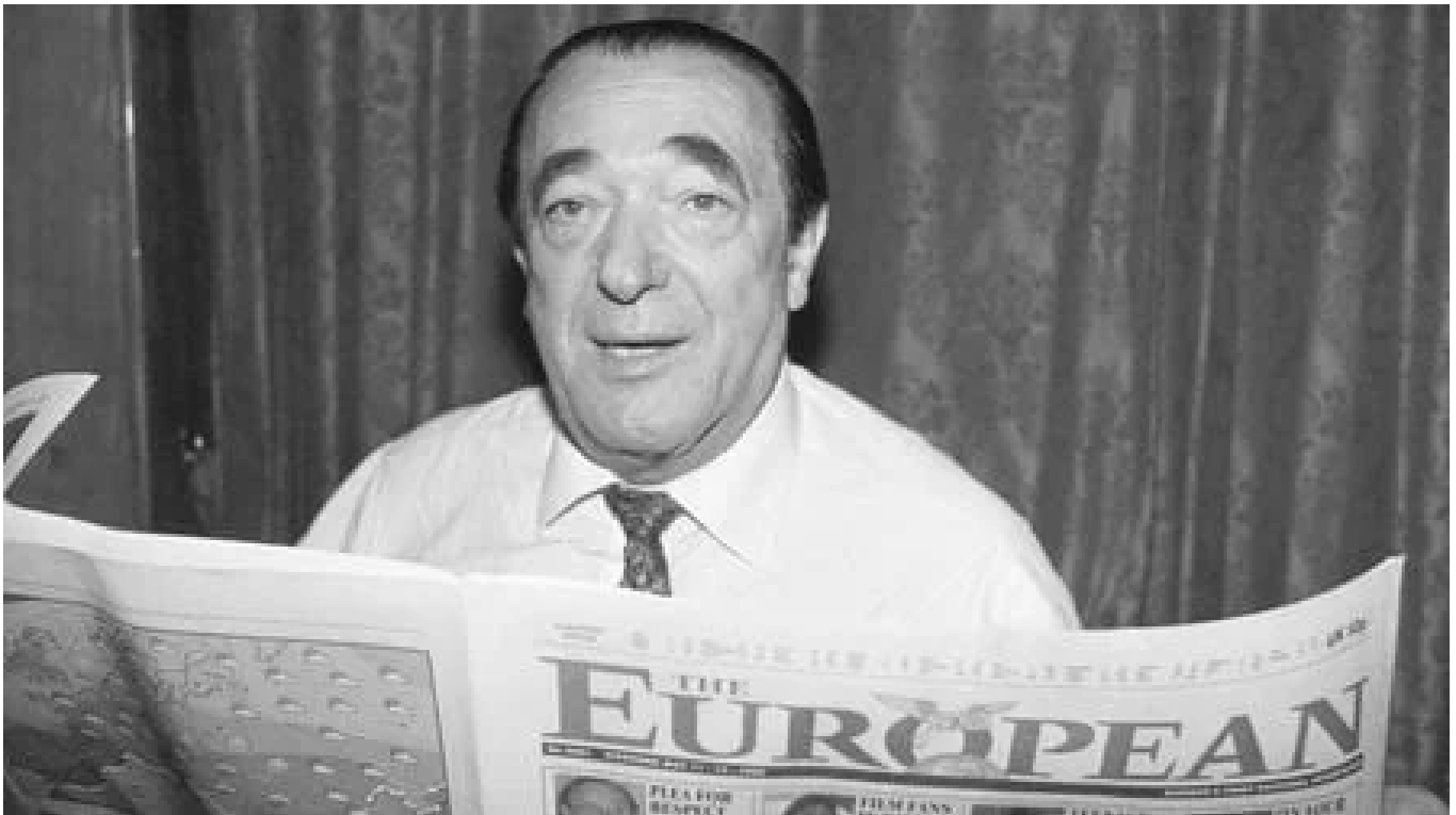
Robert Maxwell poses with the first edition of “The European” newspaper he founded in 1990

During this period, Maxwell’s ties to Israeli intelligence deepened in other ways, particularly during the time when Yitzhak Shamir was prime minister. Shamir, previously a leader of the Zionist terrorist group known as Lehi or the Stern Gang, deeply loathed the United States, a sentiment he confided to Maxwell during one of Maxwell’s visits to Israel. Shamir told Maxwell that he blamed the Americans for the Holocaust because of US failure to support the transfer of European Jews to Palestine prior to the war. Shamir’s views on the US likely informed Israel’s more aggressive espionage targeting the US that emerged during this time and in which Maxwell prominently figured.