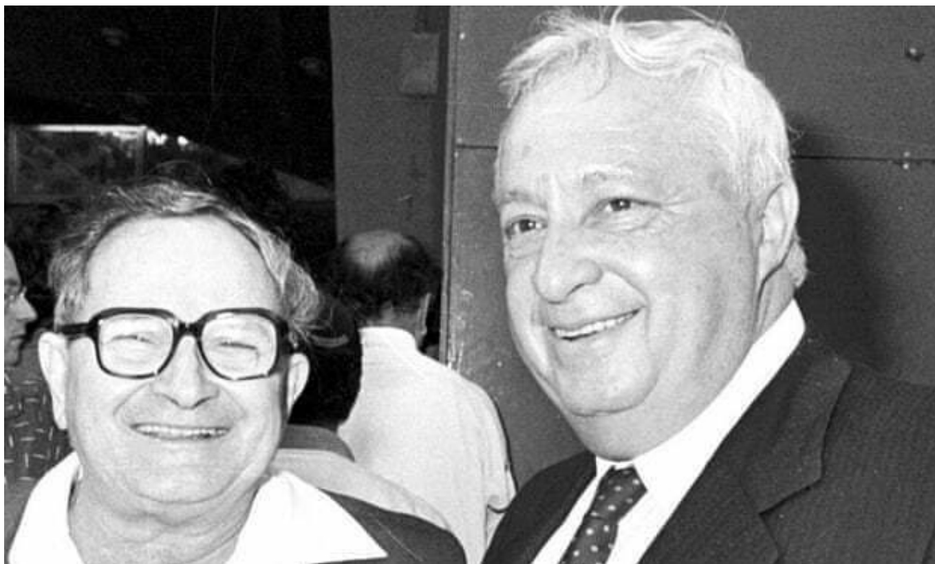
Rafi Eitan with Israeli politician Ariel Sharon in 1987

Rafi Eitan, the notorious Israeli spymaster who served as Jonathan Pollard's handler and who played a key role in the creation of the Talpiot program , was serving as the head of the (now defunct) Israeli intelligence service known as Lekem when he heard of a revolutionary new software program being used by the US Department of Justice. The program was known as the Prosecutors Information Management System, better known by its acronym PROMIS.