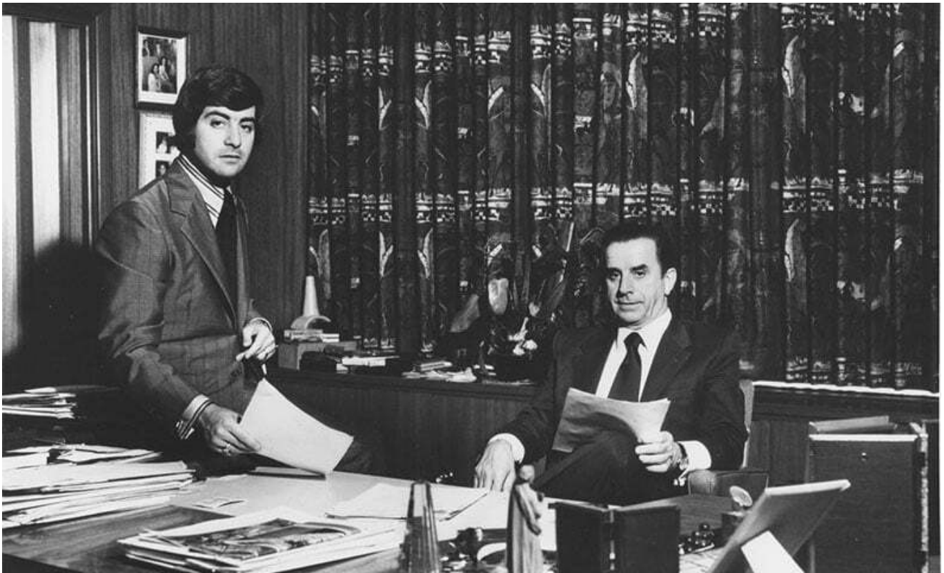
Edward DeBartolo Sr. and his son.

Edward DeBartolo Sr. was born in 1909 and got his start working for his stepfather's construction business, Michael DeBartolo Construction. In the 1940s, DeBartolo founded his own company, Edward J. DeBartolo Corporation, and eventually became a real estate baron, particularly of suburban shopping malls and complexes. Some of his earlier ventures, such as the 1960 purchase of the Thistledown racetrack near Cleveland, Ohio, involved the Emprise Corporation, which was indicted and convicted in 1972 for racketeering and serving as a front for organized crime. In 1976, Cleveland Magazine described DeBartolo's business empire as "deliberately labyrinthian" with each venture encapsulated as a separate corporation, some of them joint ventures with the real estate arm of a major retailer.