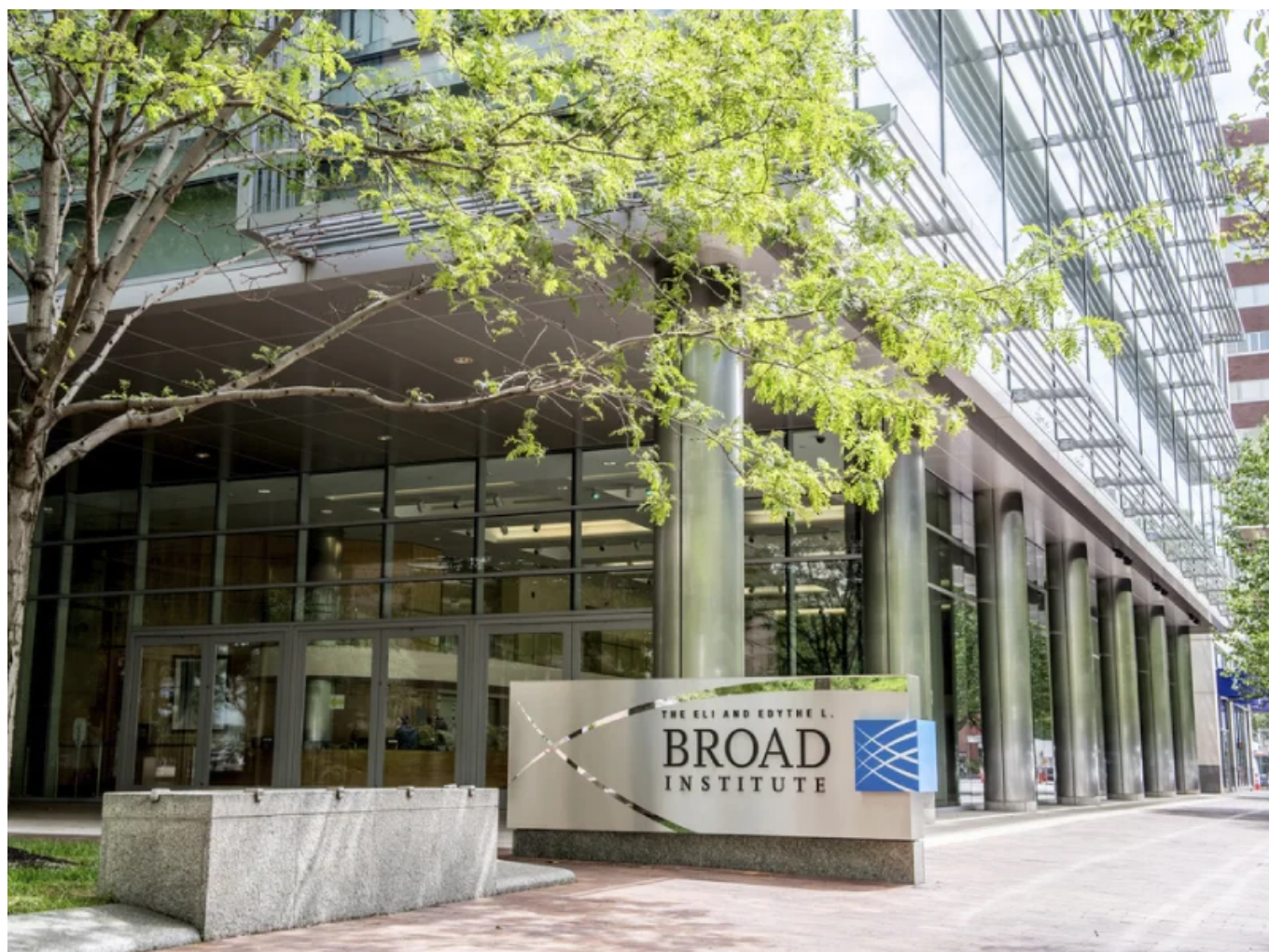
The Broad Institute

As mentioned, Lander is poised to play a major role in ARPA-H/HARPA if and when it materializes. Before becoming the top scientist in the country, Lander was president and founding director of the Broad Institute. While advertised as a partnership between MIT and Harvard, the Broad Institute is heavily influenced by Silicon Valley , with two former Google executives on its board, a partner of Silicon Valley venture capital firm Greylock Partners, and the former CEO of IBM, as well as some of its top endowments coming from prominent tech executives.