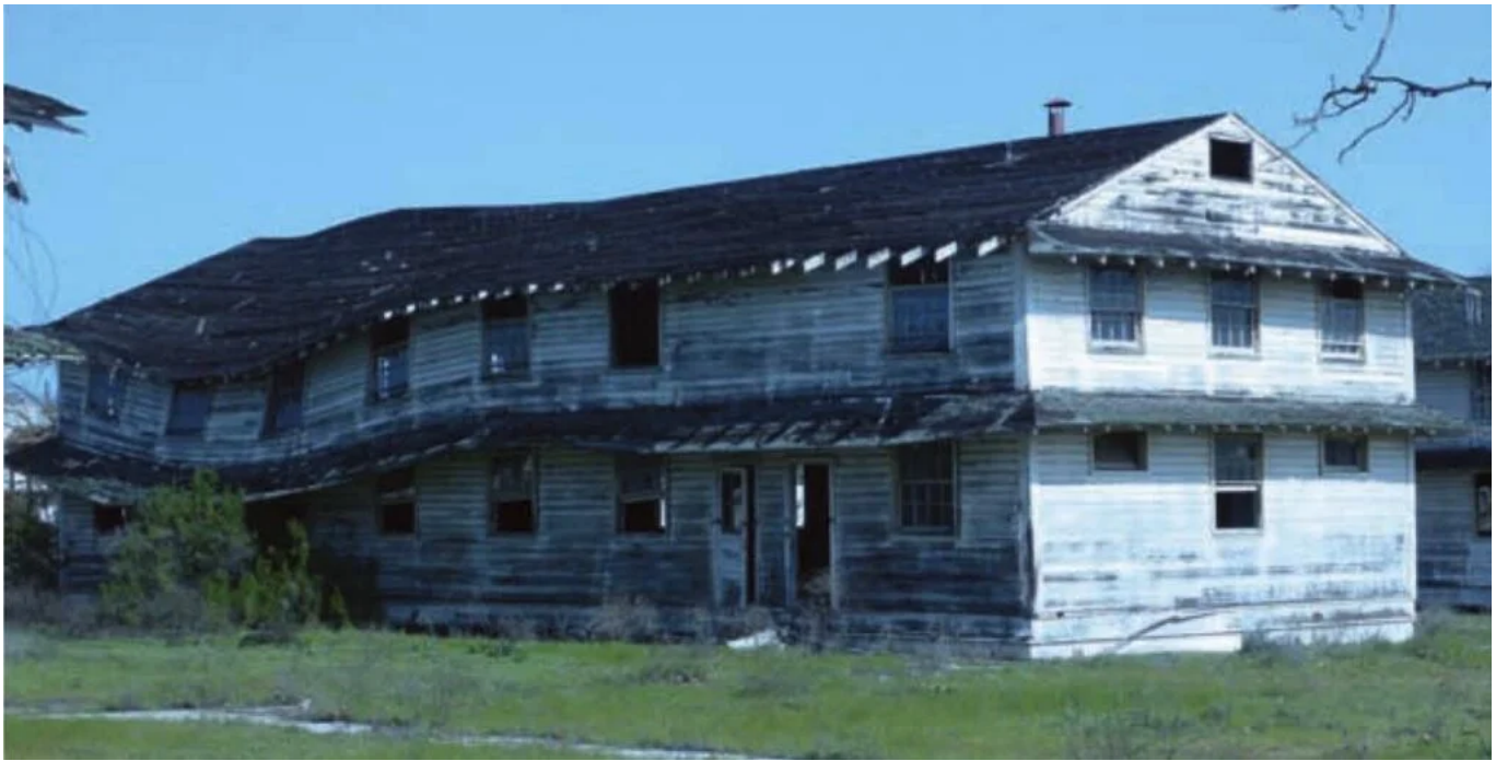
One of the hundreds of condemned buildings at Camp Roberts, many of which contain lead, asbestos, and other contaminants.

After migrant children began to be sent to the bases in Texas, the Pentagon announced on April 3 that California's Camp Roberts had been approved to house unaccompanied migrant children. While not known for high rates of sex crimes like the Texas bases, Camp Roberts has long had major sanitary and environmental issues much like Fort Bliss and Joint Base San Antonio.