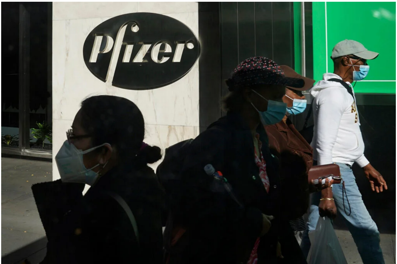
Pedestrians walk past Pfizer world headquarters in New York on Monday Nov. 9, 2020. Pfizer says an early peek at its vaccine data suggests the shots may be 90% effective at preventing COVID-19, but it doesn’t mean a vaccine is imminent.

Pfizer’s history of being fined billions for illegal marketing and for bribing government officials to help them cover up an illegal drug trial that killed eleven children (among other crimes) has gone unmentioned by most mass media outlets, which instead have celebrated the apparently imminent approval of the company’s Covid-19 vaccine without questioning the company’s history or that the mRNA technology used in the vaccine has sped through normal safety trial protocols and has never been approved for human use. Also unmentioned is that the head of the FDA’s Center for Drug Evaluation and Research, Patrizia Cavazzoni, is the former Pfizer vice president for product safety , who covered up the connection of one of its products to birth defects .