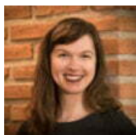
Author Whitney Webb

coronavirus government intelligence military