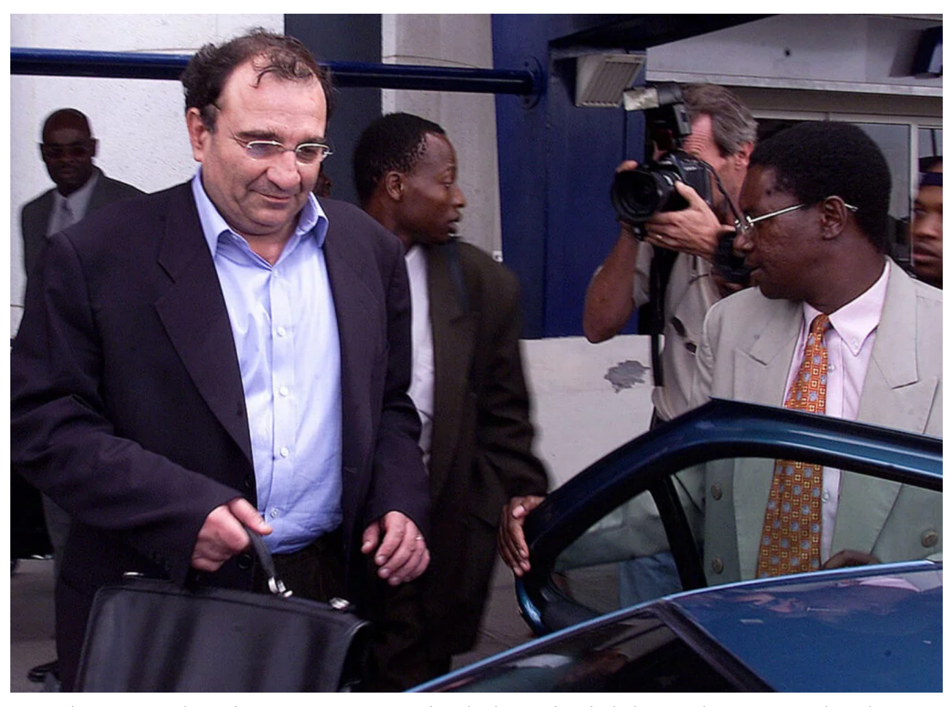
Ari Ben-Menashe arrives at Harare International Airport, in Zimbabwe, Feb. 22, 2002.

Prior to his arrest in November 1989, Ben-Menashe was a high-ranking officer in a special unit of Israeli military intelligence. He would <u>later claim</u> that his arrest for attempting to sell American-made weapons to Iran was politically motivated, as he had threatened to expose what the U.S. government had done with the stolen PROMIS software if the U.S. did not cease providing Saddam Hussein's Iraq with chemical weapons. Ben-Menashe was <u>later acquitted</u> when a U.S. court determined that his involvement in the attempted sale of military equipment to Iran was done on behalf of the Israeli state.