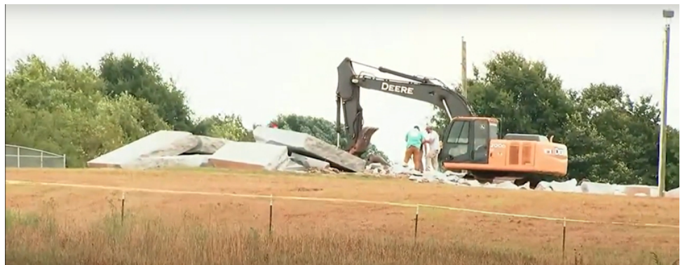
The remains of the Guidestones.