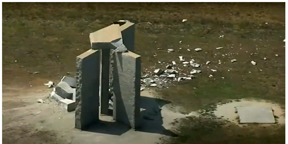
The Guidestones after the blast.

The blast reduced one of the slabs to rubble and severely damaged the capstone. After the detonation, a car was filmed leaving the scene. The Georgia Bureau of Investigation said in a statement that it is investigating the explosion together with the Elbert County Sheriff’s Office.