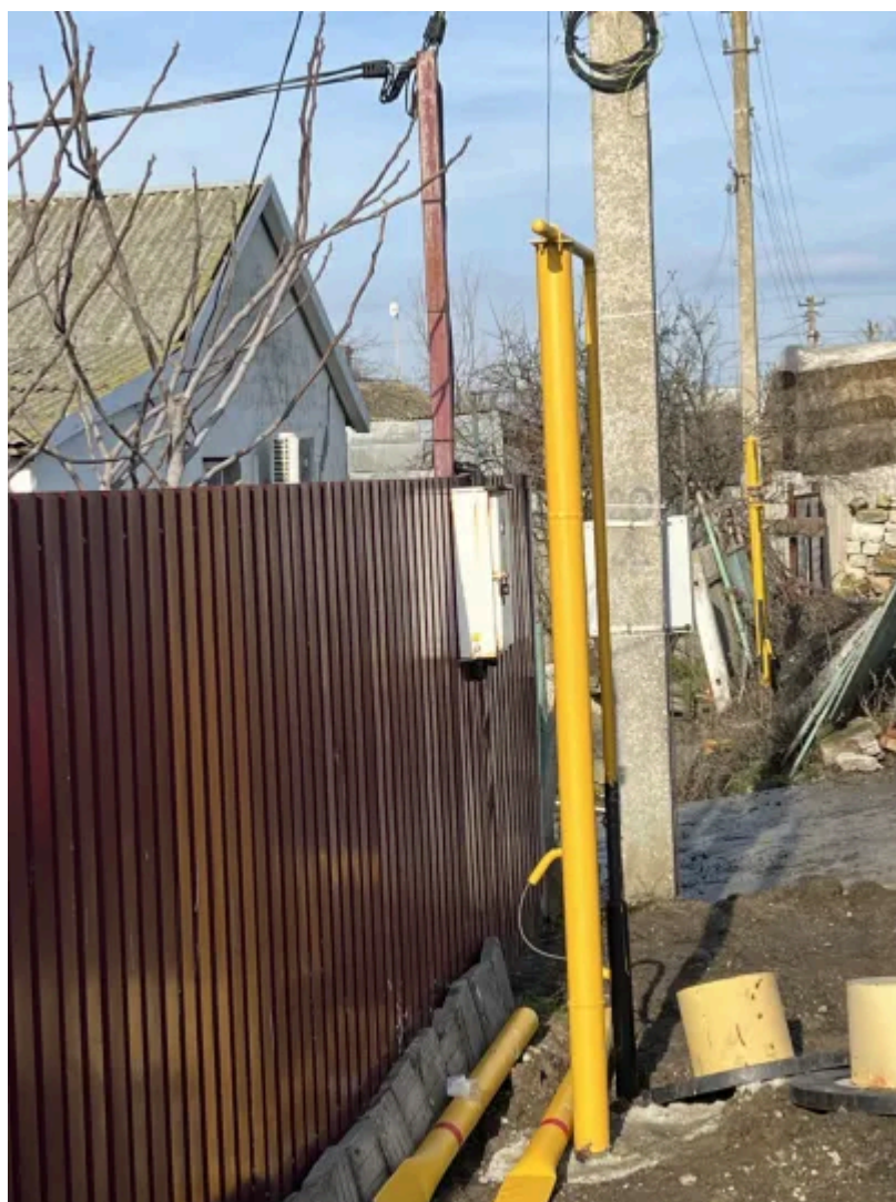
Gas lines being installed outside Fatima's home in Batalnoye, January 2024

They had felt their house shake when Ukrainian missiles struck the Novocherkassk, and their nights were often interrupted by the sounds of Ukrainian drones flying overhead, and the launch of Russian air defense missiles in response. It's a hard life, made even more so by the neglect shown the village during the time of Ukrainian rule.