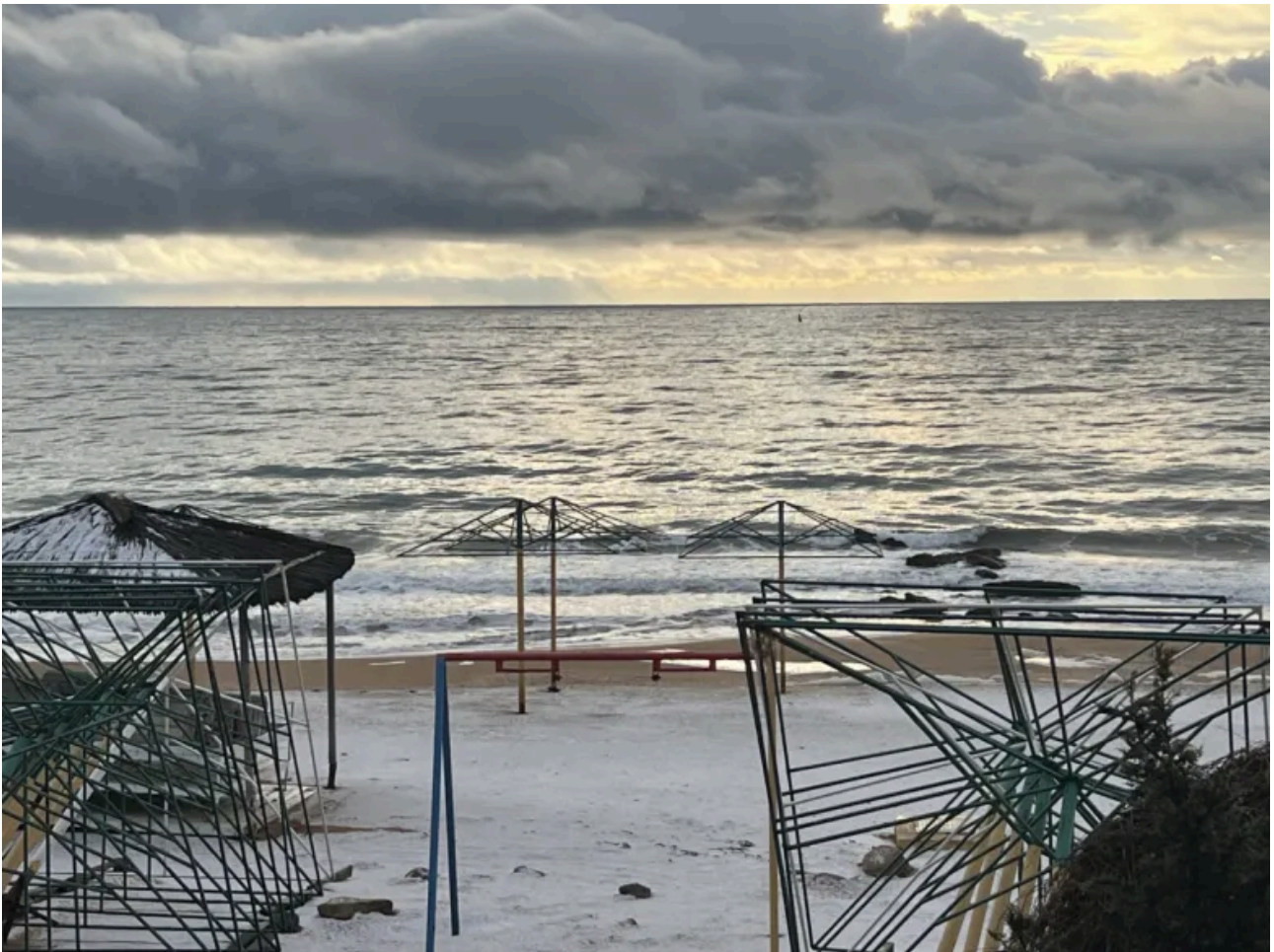
The Black Sea beachfront at Feodosia.

penetrated Russian air defenses, hitting the Novocherkassk, a large landing ship, and lighting up the night sky in a dramatic fireball. And anyone driving in and around Feodosia cannot help but notice the presence of Russian defenses.