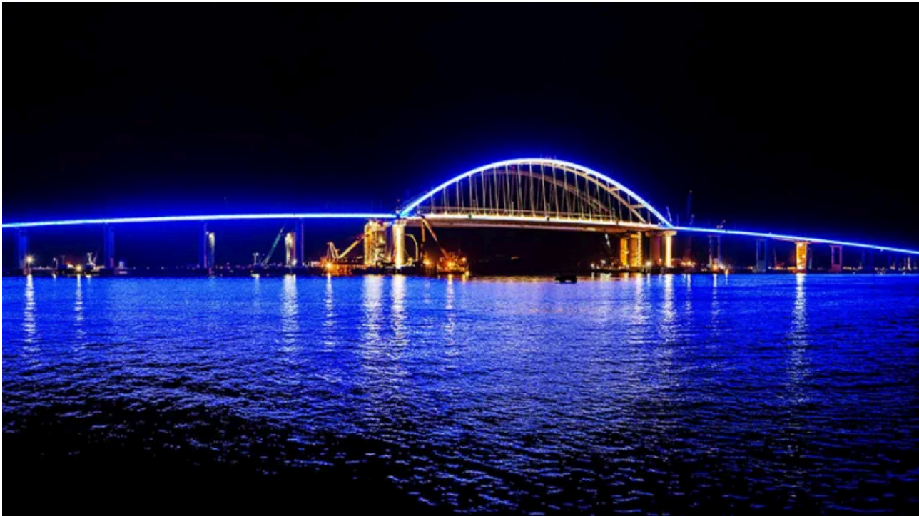
The Crimean Bridge at night.

desalination plants. While this effort wasn't sufficient to save much of Crimea's agriculture, it did provide for the basic needs of the population. The Russian government also constructed the Crimean 'Energy Bridge,' laying down several undersea energy cables across the Kerch Strait that effectively compensated for the loss of power brought on by the destruction of the Ukrainian power lines.