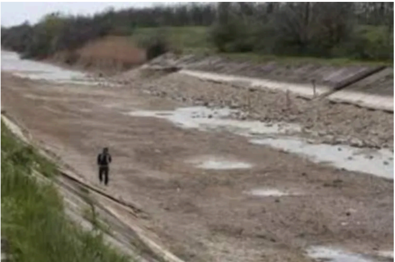
The Northern Crimea Canal after Ukraine blocked the water supply.

Soon thereafter, the predominantly Russian-speaking population of Crimea undertook actions to separate from the new Ukrainian nationalist government in Kiev. On March 16, 2014, the Autonomous Republic of Crimea and the city of Sevastopol, both of which at that time were legally considered to be part of Ukraine, held a referendum on whether to join Russia or remain part of Ukraine. Over 97% of the votes cast were in favor of joining Russia. Five days later, on March 21, Crimea formally became part of the Russian Federation.