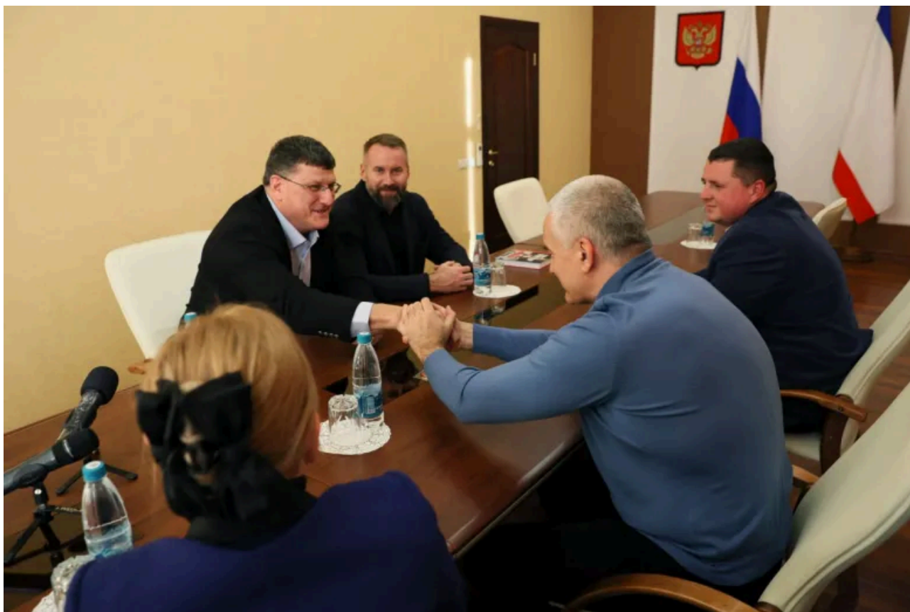
The Author (left) with the Head of the Crimean Republic, Sergei Aksyanov (right)

Deliberate neglect, followed by a blockade and now war have failed to break the resolve of the peninsula's inhabitants.