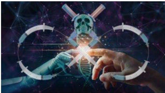
mRNA Vaccines, Transhumanism, And The Battle For Our Souls