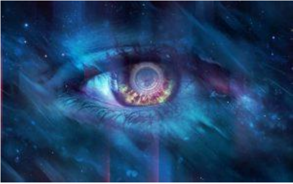
The Perilous Path Towards Awakening