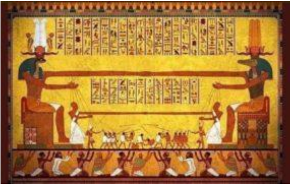
Divide & Conquer: The Occult Game of Stalking