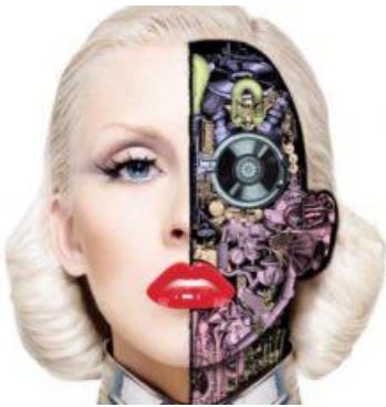
Organic Portals – Soulless Humans