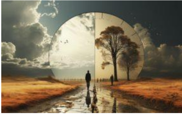
Fear, Freedom, and Answering The Call