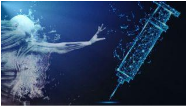
COVID Vaccines – Consequences For The Soul,...