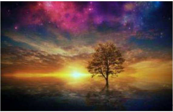
The Necessity to Surrender to the Divine and...