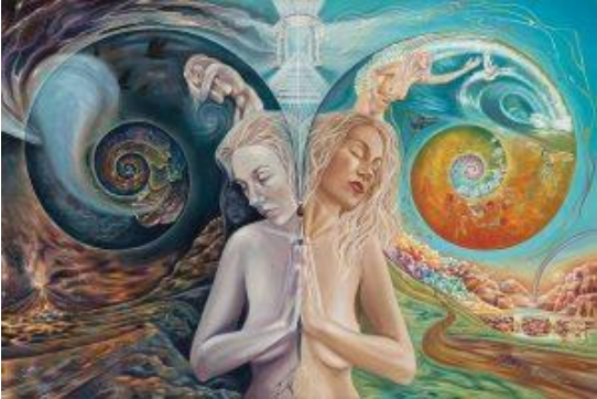
Soul Evolution, Universal Laws, and Karma in The Body