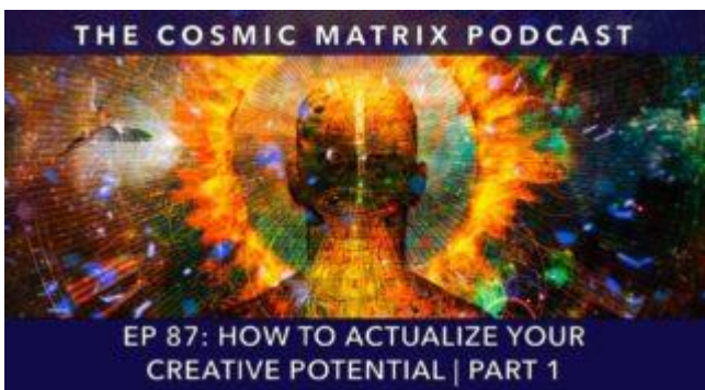
How To Actualize Your Creative Potential | TCM #87 (Part 1)

SUBSCRIBE TO THE COSMIC MATRIX PODCAST (ONLY PART 1 OF EACH EPISODE - FOR 2ND HOUR SIGN UP TO THE MEMBERSHIP)