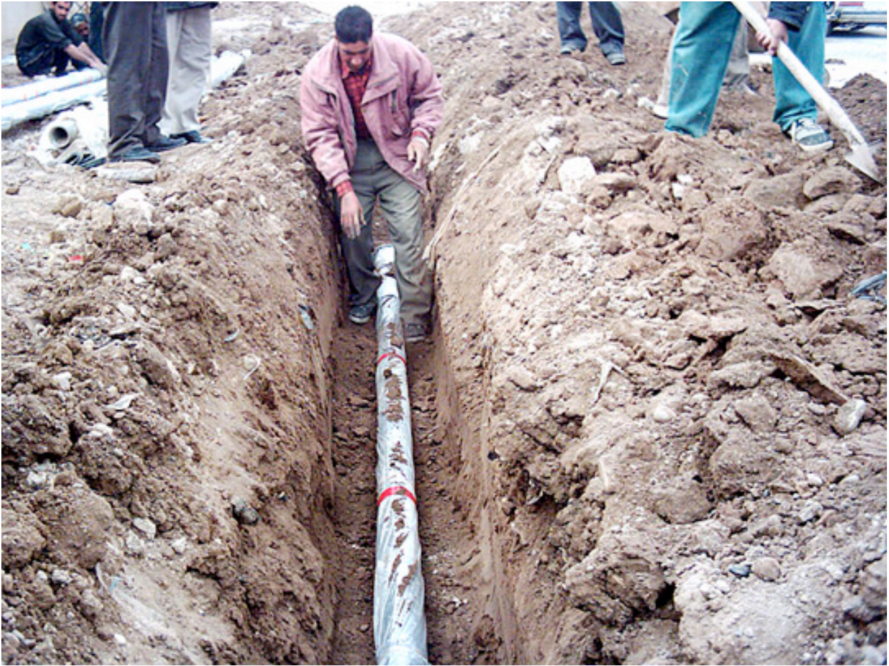
[ Iraqis laying a water pipe.]