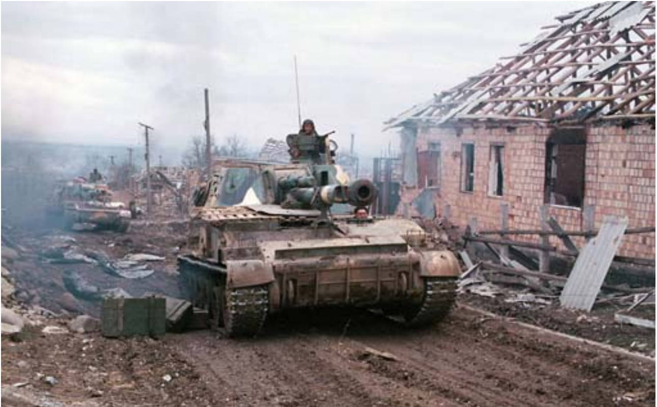
[Russians destroying a village in Chechnya]

outlets like Pravda and getting them published. I scolded the Russians that they had not exposed the US terrorism in Iraq and refused to make the bargain that they wanted. They wanted the US to ignore their terrorism in Chechnya, in exchange for ignoring the US terrorism in Iraq and Afghanistan. Two wrongs do not make a right. It is the duty of one's allies and enemies to point out one's errors so that one can correct them quickly before one has to answer to God for them. Christ healed people, not tortured them. He raised the dead, not killed people. He gave money to the poor, not underpaid them and taxed them.