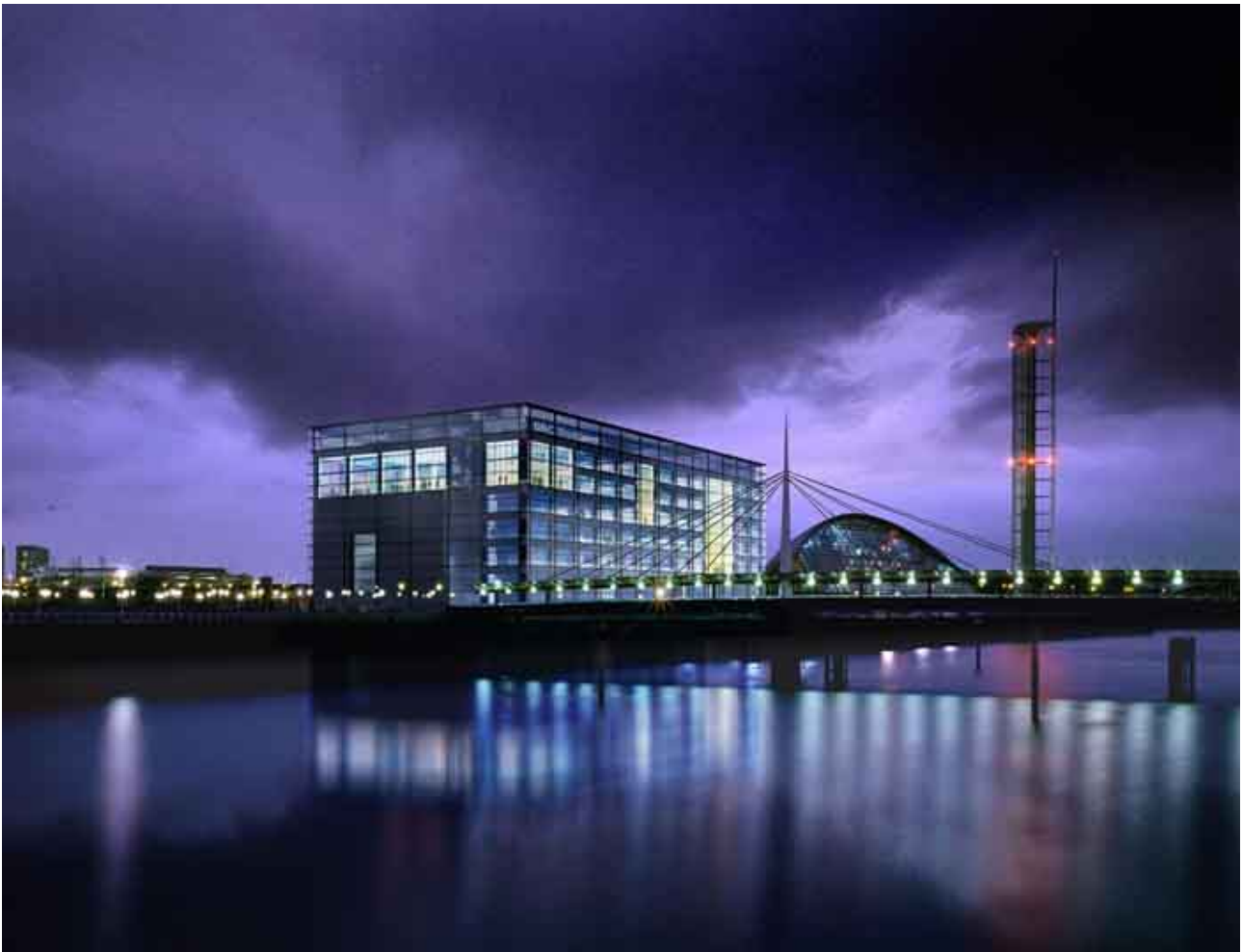
BBC Headquarters Glasgow

Please watch the BBC 3 Part Documentary The Power of Nightmares at