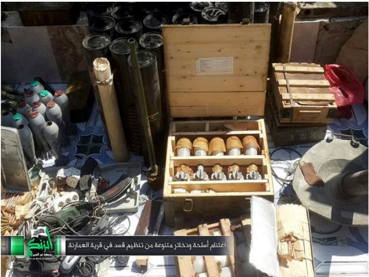
The Turkish-backed Sham Legion, a member of the Free Syrian Army, published these photos on its social media accounts in August 2016. The screenshots show various munitions captured from Kurdish YPG fighters of Syrian Democratic Forces near Jarabulus in Northern Syria.

Serbia's Ministry of Trade told BIRN and OCCRP the 8,860 mortar shells from “lot KV-01/15” had been delivered to Cameroon and Saudi Arabia – neither of which have backed Kurdish rebels in Syria – and SOCOM's US base in Kuwait, a major logistical base for the Pentagon's programme to arm Syrian rebels.