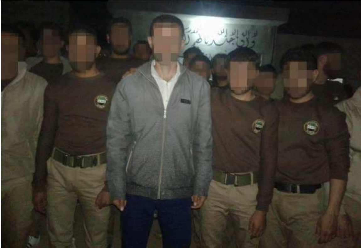
FSA soldiers at the Syrian-Turkish border on their way to another training camp.

The rebels were taken from the airport to a secret military camp. Stripped of their mobile phones, they were cut off from the outside world in an undisclosed location in the Saudi desert.