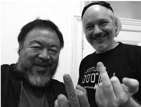
Ai Weiwei and Julian Assange in the Ecuadorian embassy.