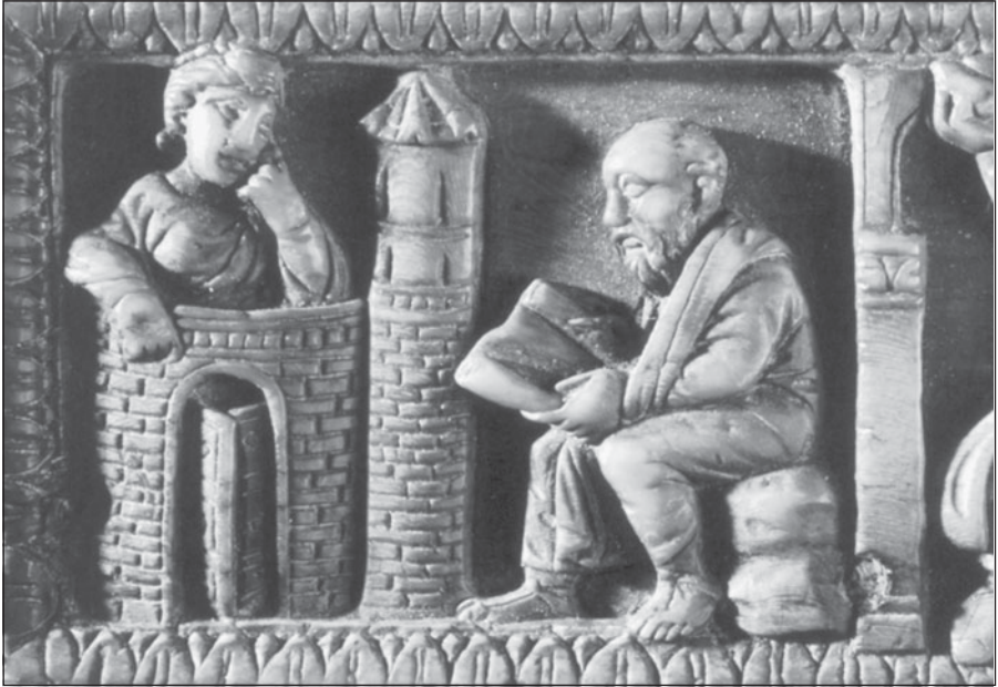
Portrayal of Paul preaching his gospel, seated by a tower, from which his soon-to-be disciple Thecla listens with rapt attention, from an ivory panel of the fifth century.

Once more she tracks down Paul and informs him that she has now been baptized. She receives his blessing, as he tells her to go forth to “teach the word of God.” She does so and lives a long and happy life as a single and celibate proclaimer of the gospel. 5