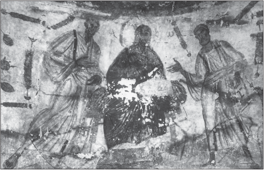
One of the earliest surviving pictures of Peter, Jesus, and Paul from a catacomb painting in Rome.

The Gospel of Matthew was written some ten or fifteen years after Mark, around 80 or 85 CE. Many of Mark's stories are replicated in Matthew, probably because Matthew simply copied them, changing them as he saw fit (as well as adding a number of stories not found in Mark). As it turns out, Matthew doesn't mention Jesus' naming of the twelve disciples until much later in his ministry. In fact, it does not come until after he has delivered his famous Sermon on the Mount (which is found in Matthew but not in Mark) and performed a number of miracles in Matthew 8–9. Moreover, in his naming of the apostles Matthew has slightly altered the wording of Mark's account. Instead of saying that "he gave to Simon the name Peter," Matthew simply says that the first of the disciples was "Simon who was called Peter" (Matt. 10:2). In other words, in this later account, "Peter" appears simply to be Simon's well-known nickname, not the epithet that Jesus himself gave him.