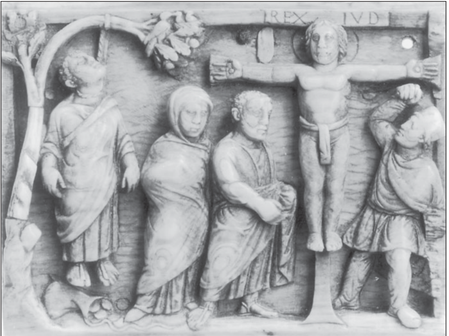
One of the earliest surviving portrayals of Jesus’s crucifixion, from a miniature ivory panel of the fourth century. For Paul, Jesus’s crucifixion was the key to salvation.

Once again we are handcuffed by our sparse source material. Some scholars have argued that Paul was frightened by the early Christian movement, that he was afraid of what might happen to the broader Jewish population if the Romans got wind of this upstart new religion. The logic would be that if the Roman authorities learned that a Jewish sect had begun to worship a criminal crucified by the state as a future “king,” they might not take kindly to the development and react against it. This explanation strikes me as a bit too speculative. Why would Roman leaders punish non-Christian Jews for what a breakaway Jewish sect was saying? Moreover, Paul never shows fear of Roman reprisals after becoming a follower of Jesus and never hints that this was his problem with Christians before he himself converted.