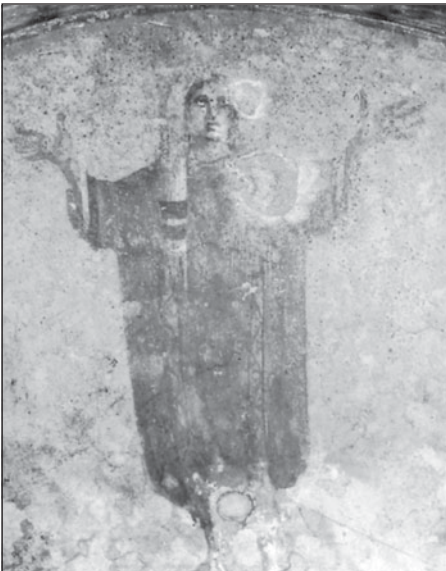
Painting of a Christian woman in prayer, from the Catacomb of Priscilla.

Nowhere else in the Gospels do you find such a confusion of reporting. Some readers have argued that this is precisely what you might expect. If something as mind-boggling as a resurrection had occurred and these women were the first to learn, they may well have been completely discombobulated and the stories may have gotten jumbled up in no time. But even if that is true, the historian is still left with the problem of knowing what most likely happened, given the fact that our various sources don't appear to agree in the