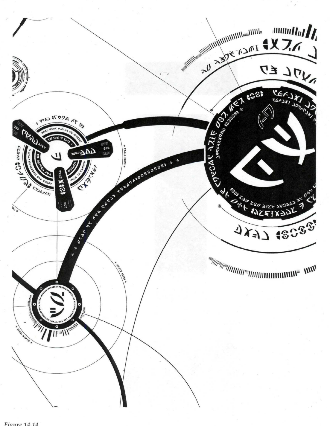
Figure 14.14 Compound junction in a dual-link union with heavy-state tri-switch and diffuser.