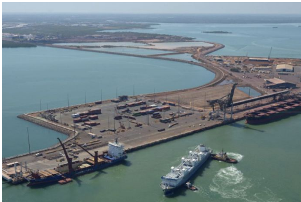
PHOTO: Chinese-owned Landbridge Group has a 99-year lease for Darwin Port.

"Put it this way, there are no Nobel Prize winners in the UAP," he said.