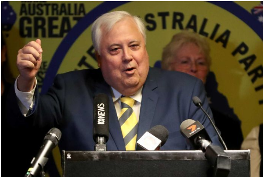
PHOTO: The UAP is preferencing the CLP in the NT, despite Clive Palmer's animosity to port leases.

The leasing of Darwin's port to a Chinese company for 99 years has reared its head in the race to claim the Northern Territory seat of Solomon, with two "strange bedfellows" at odds over the issue yet still offering each other their top billing on the ballot paper.