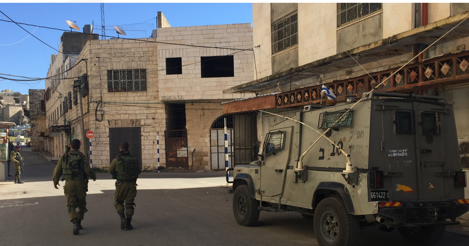
Israeli soldiers deployed near a military checkpoint on Shuhada Street in the occupied West Bank city of Hebron on January 16, 2016.