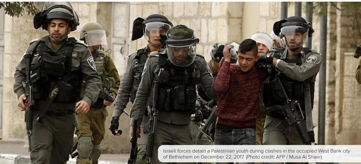
Israeli forces detain a Palestinian youth during clashes in the occupied West Bank city of Bethlehem on December 22, 2017.