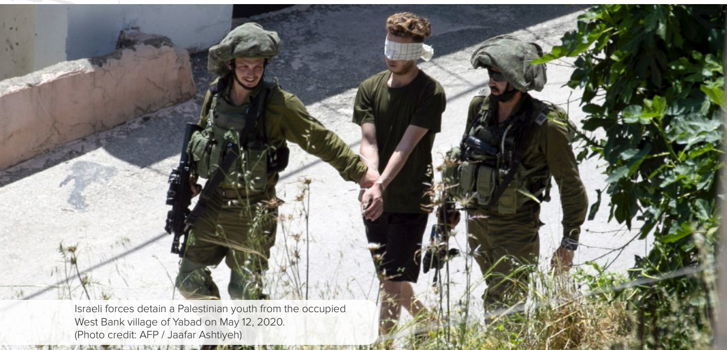
Israeli forces detain a Palestinian youth from the occupied West Bank village of Yabad on May 12, 2020.