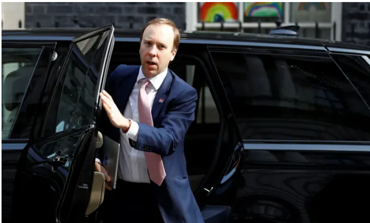
The health secretary, Matt Hancock.

During the coronavirus crisis, care homes have been asked to take recovering Covid-19 patients, leading to concerns that they may spread the infection if not properly isolated and treated, which is not always possible in care settings.