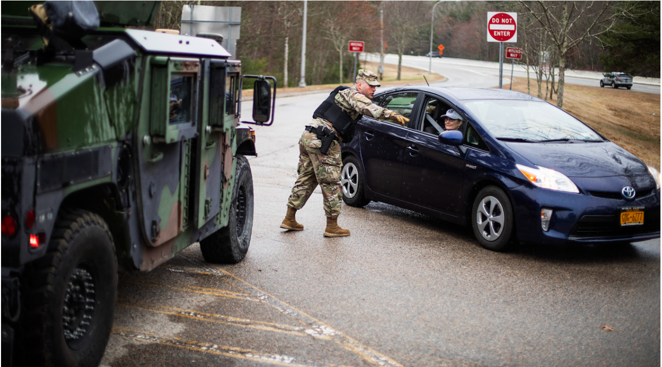
Rhode Island National Guard Military Police direct a motorist with New York license plates to a checkpoint, March 28, 2020

South Carolina's police have been empowered to break up any public gatherings of more than three people .