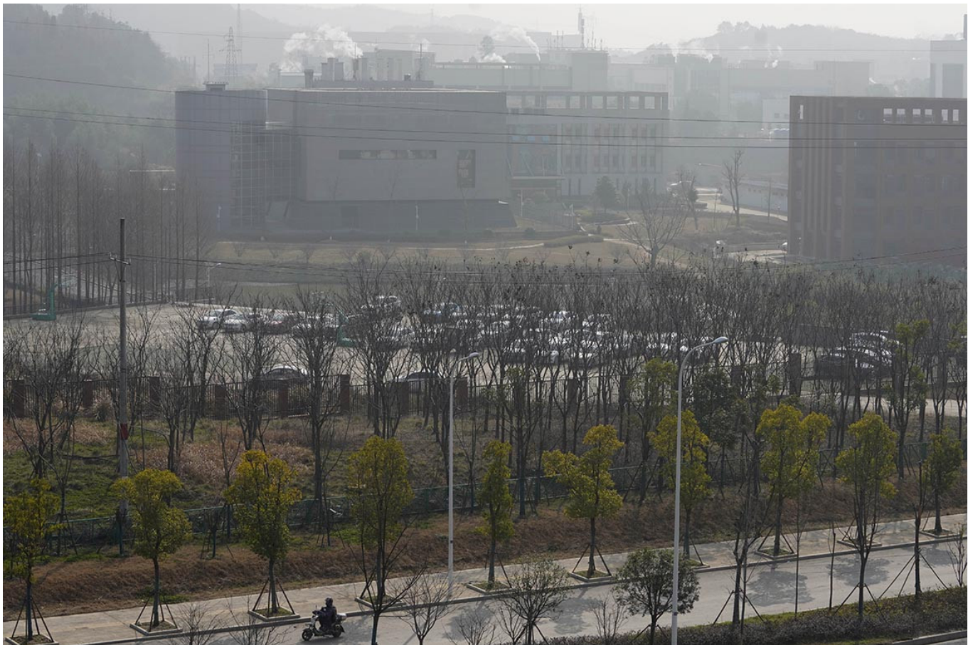
A view of the P4 lab inside the Wuhan Institute of Virology.

After seeing a risky lab, they wrote a cable warning to Washington. But it was ignored.