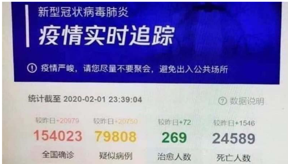
Tencent screengrab as of late Feb 1, showing far higher infections.

And while the number of cured cases was only 269, well below the official number that day of 300, most ominously, the death toll listed was 24,589, vastly higher than the 300 officially listed that day .