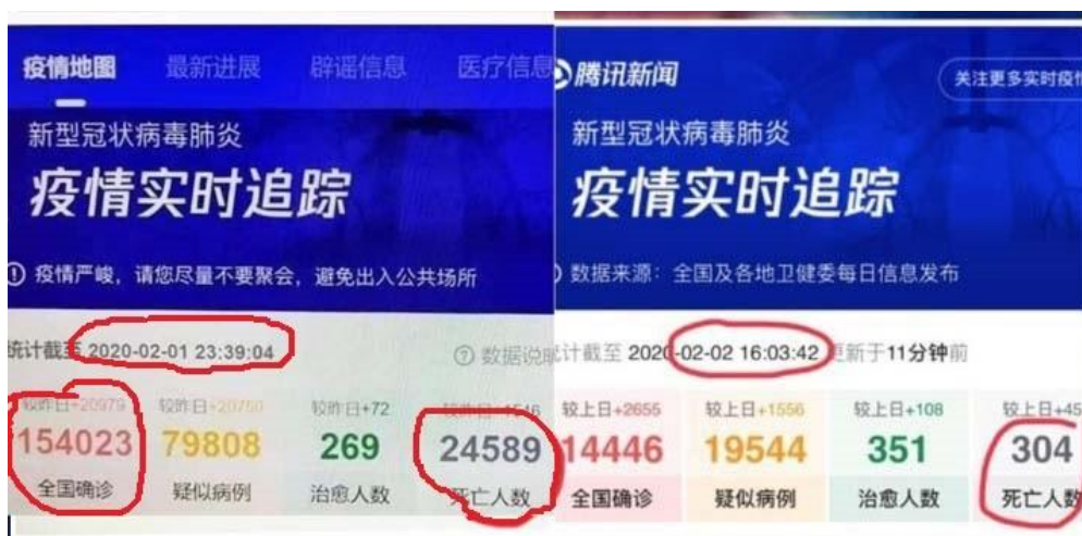
Screengrab showing higher numbers (left), chart showing "official" numbers (right).

Moments later, Tencent updated the numbers to reflect the government's "official" numbers that day.