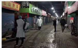
The Wuhan seafood market, which is at the centre of the pneumonia outbreak, has been closed. (Photo: Reuters)

Source: Global Times Published: 2020/2/22 20:14:18 Last Updated: 2020/2/23 1:29:53