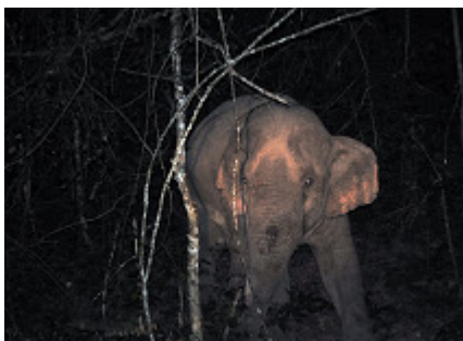
Night shot of a wild elephant