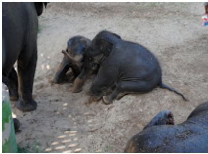
5 and 7 month olds playing