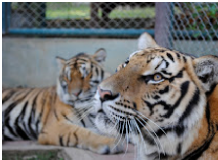
Visiting tigers (inside the cages) in Chiang Mai