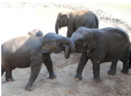
Canoodling at Elephant Nature Camp, Thailand