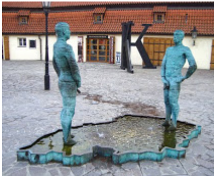
Kafka Museum garden, Prague