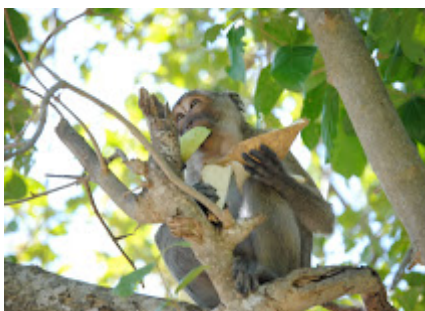
Rhesus macaque: "I need three hands for this meal"