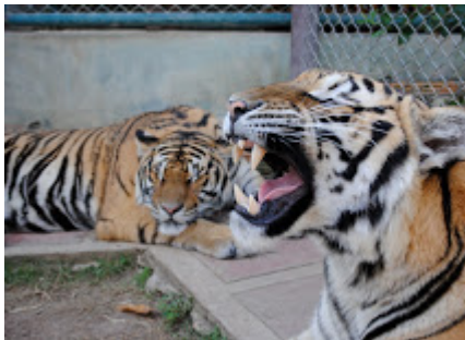
I think I'm in the wrong cage...