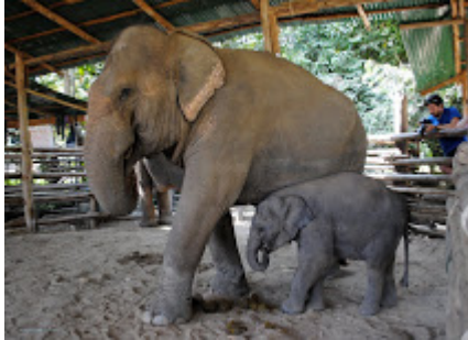
Mum and her 5 month old infant