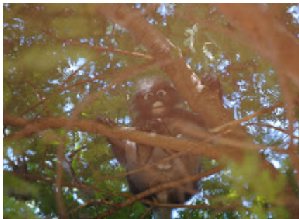
Dusky Langur, curious about us humans in his territory