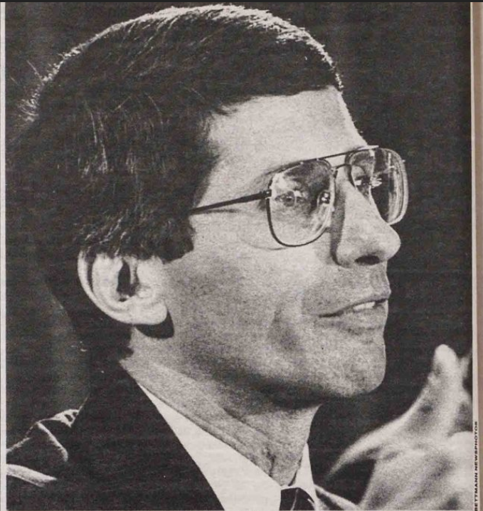
Dr. Anthony Fauci, Director of National Institute of Allergy and Infectious Diseases