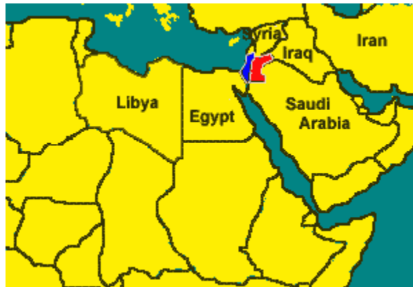
Israel today Jordan today "Pal estine" Before 1923

Take a close look at this PRESENT DAY MAP of the Middle East in which you can see that 22 Arab and/or Muslim [Iran is not considered Arab] nations completely engulf Israel . If someone can explain to me how "expansionist Israel" has "taken over" the Middle East, please email me! The Arab countries occupy 640 times the land mass as does Israel and outnumber the Jews of Israel by nearly fifty to one. So much for Arab propaganda!