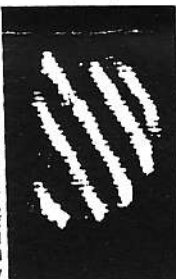
■ A close-up of the mysterious light

As experts poured over the latest alleged UFO sighting in Central Scotland, Mrs Ross told of her encounter: "I got up at 6am and looked out of my bedroom window. I saw what looked like a big snowball in the sky. Its outside edges then became pointed."