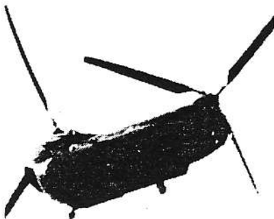
LOW FLYER: A Chinook

"At 1.30pm on Monday, August 12, a number of people in the Wigan area heard a very noisy helicopter overhead.