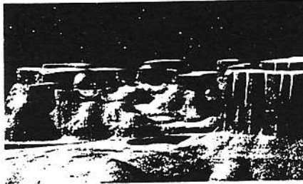
Net image: hubcaps on Mars?

UFO lore and alien visitations that makes amusing reading, especially for sceptics.