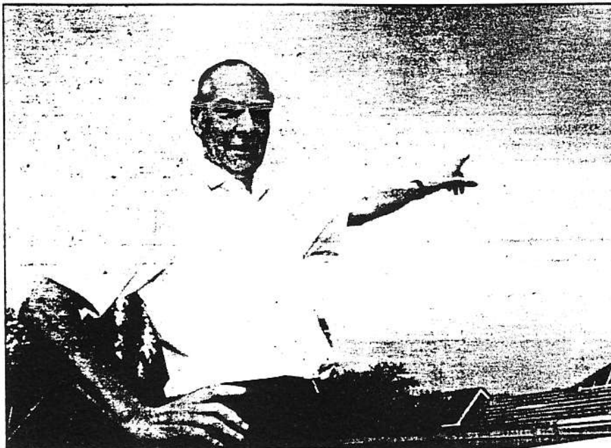
THE TRUTH is out there somewhere...