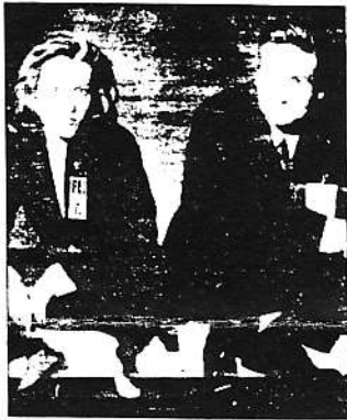
X Files TV stars Gillian Anderson as agent Dana Scully and David Duchovny as Fox Mulder.

Since 1996 began there have been dozens of glimpses of a triangular set of lights hovering above various parts of the county.