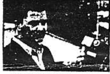
SKY WATCH: Pete Edwards of DPRA