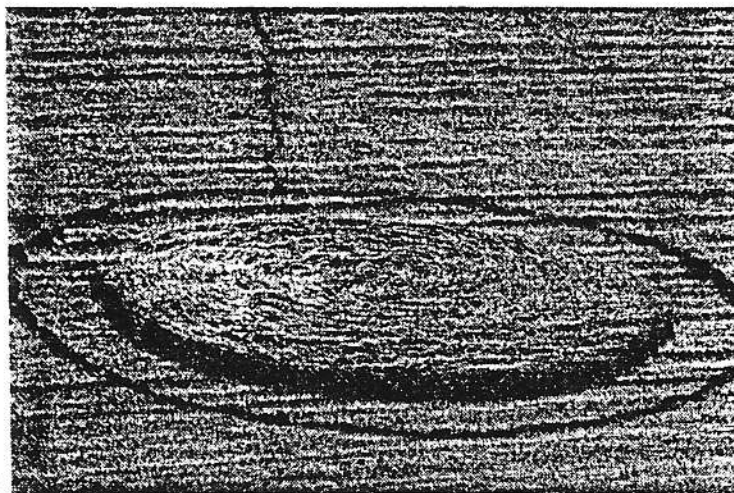
CROP CIRCLES: Investigations into the mystery continue.

The programme, screened on Thursday, March 21, at 7.30pm, interviews several Cheshire people who claim to have spotted UFOs and also talks to local experts.