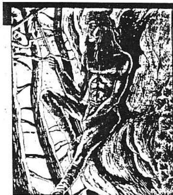
WARNING: White Arrow