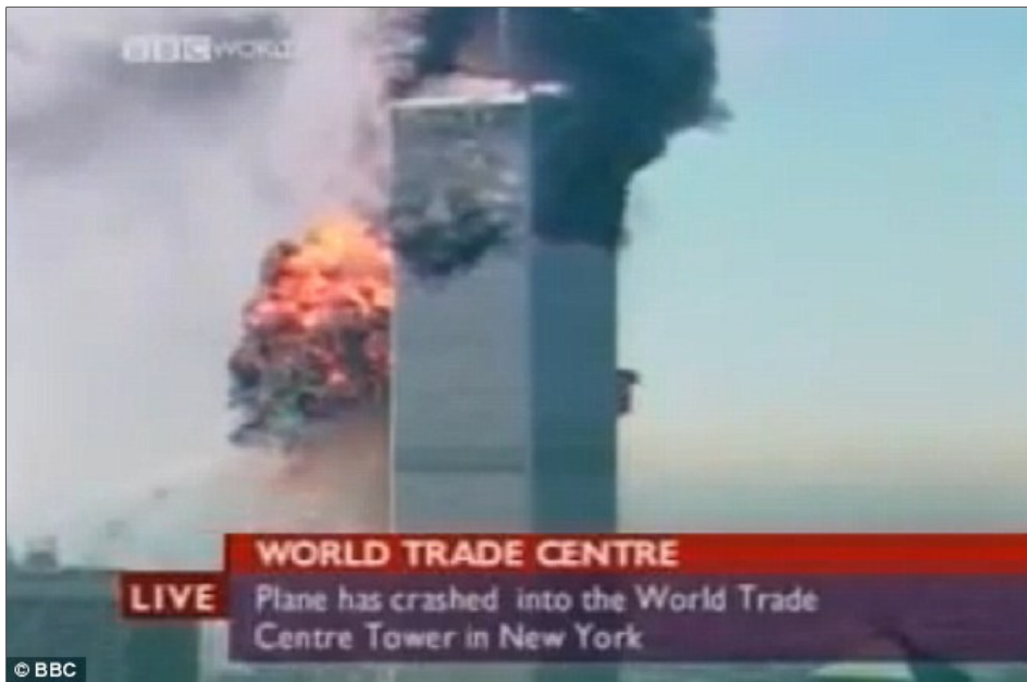
Flashback: This is a grab from BBC World's breaking news coverage of the September 11 attacks in 2001

District Judge Stephen Nicholls said: 'This is not a public inquiry into 9/11. This is an offence under section 363 of the Communications Act.'