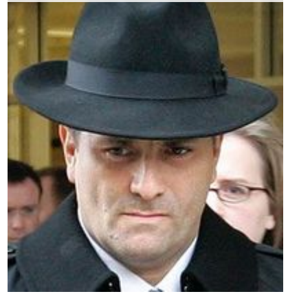
Jack Abramoff, Deep state operative

Jack Abramoff: owned these casino boats. A Zionist Jew, he entertained the Arab patsies aboard his yacht. Abramoff was a Bush Administration insider having been on the Transition Advisory Team assigned to the Department of the Interior in 2001. Abramoff is a lobbyist who is a central figure in a plethora of political scandals, fraud, and other scams. He was sentenced to five years in prison term for fraud, conspiracy, and tax evasion. He also had foreknowledge of the War In Iraq .