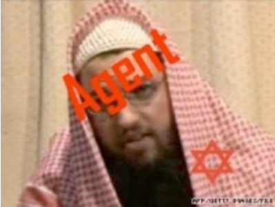
Adam Yahiyeh Gadahn

One possible translation of " Al-Qaeda " is "The Base", but it also translates as "The Toilet." The Arabic word 'Qa'ada' means 'to sit' (on the toilet bowl). Arab homes have three kinds of toilets: 'Hamam Franji' or 'Al-Qaeda' or foreign toilet, "Hamam Arabi" or Arab toilet, and a potty used for children called 'Ma Qa'adia' or 'Little Qaeda.' 'Ana raicha Al Qaeda' is a colloquial expression for "I'm going to the toilet," so this seems like an unlikely choice of name for such a group.