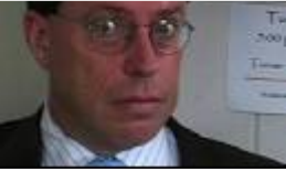
Philip Zelikow, 9/11 Commission Executive Director

By using the Wikispooks.com servers, you agree to its use of cookies More information OK