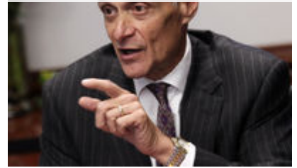
Michael Chertoff, a US/Israeli deep state actor who held multiple legal roles