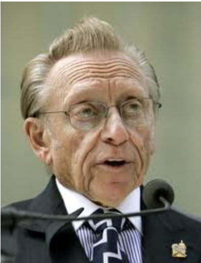
Larry Silverstein, who made billions of dollars from the attacks