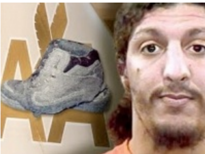
Richard Reid, the "Shoe-bomber".