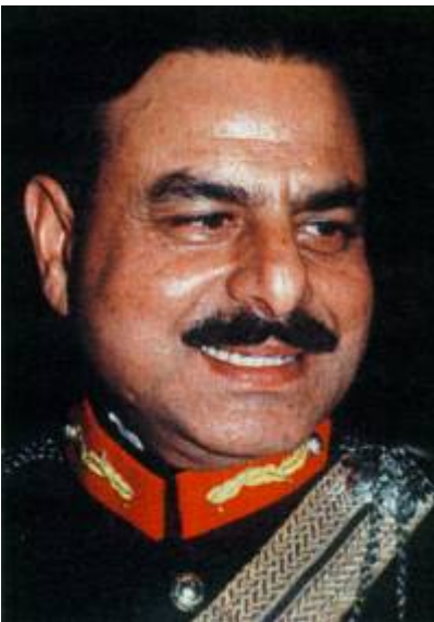
General Hamid Gul

Borchgrave , United Press International that he believes the Mossad, not al-Qaeda, were the perpetrators of the attacks, and suggests that if USA has any evidence against Al Qaeda, it should present it to an international court. He stated: "The U.S. spends $40 billion a year on its 11 intelligence agencies. That's $400 billion in 10 years. Yet the Bush Administration says it was taken by surprise. I don't believe it. Within 10 minutes of the second twin tower being hit in the World Trade Center CNN said Osama bin Laden had done it. That was a planned piece of disinformation by the real perpetrators. It created an instant mindset and put public opinion into a trance , which prevented even intelligent people from thinking for themselves." [35]