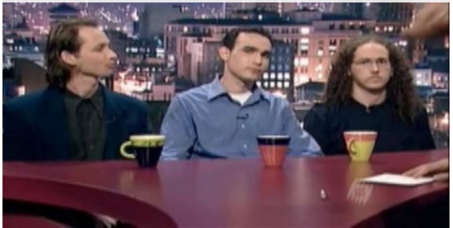
3 of the 5 "Dancing Israelis" on Israeli TV

a New Jersey local paper, The Bergen Record , that bomb sniffing dogs were brought to the van and that they reacted as if they had smelled explosives. According to the Jewish Daily Forward the FBI later determined that at least two of the Israelis were Mossad agents and that their employer, Urban Moving Systems was a Mossad front. [22]