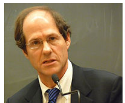
Cass Sunstein equated 9-11/Dissidence with "risks of violence".

In 2008, Cass Sunstein co-authored a paper entitled Conspiracy Theories , an effort to promote the pseudo-scientific study of what are referred to as "conspiracy theories" (a term launched by the CIA in 1968 to try to undermine criticism of the "lone nut" narrative of the JFK assassination [26] ). The abstract of Sunstein's paper mentioned that "A recent example is the belief, widespread in some parts of the world, that the attacks of 9/11 were carried out not by Al Qaeda, but by Israel or the United States. Those who subscribe to conspiracy theories may create serious risks, including risks of violence, and the existence of such theories raises significant challenges for policy and law." [27]