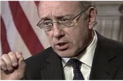
Kenneth Feinberg, in charge of the 9/11 compensation fund which required recipients waive the right to legal action

By using the Wikispooks.com servers, you agree to its use of cookies More information OK