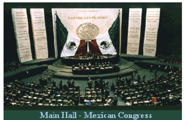
Main Hall - Mexican Congress

As reported by La Vox De Atzlan , [32] two men posing as press photographers, but in reality Israeli Mossad agents, were arrested inside the Mexican congress on October 10, 2001 armed with 9mm pistols, 9 grenades, explosives, three detonators, and 58 bullets, but were released from custody, reportedly because of pressure from the Israeli embassy. "We believe that the two Zionists terrorist were going to blow up the Mexican Congress. The second phase was to mobilize both the Mexican and US press to blame Osama bin Laden . Most likely then Mexico would declare war on Afghanistan as well, commit troops and all the oil it could spare to combat Islamic terrorism ".