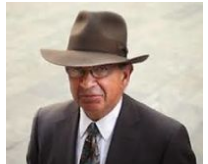
Judge Alvin Hellerstein, involved in several pieces of 9-11/Legal action

All the judges appointed were Zionist Jews: