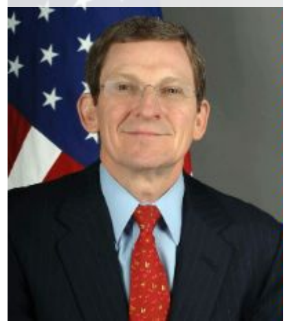
Marc Grossman, Under Secretary for Political Affairs on 9/11