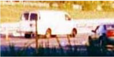
The white van used by five Israeli agents of Urban Moving Systems as they were leaving New York on 9/11.

By using the Wikispooks.com servers, you agree to its use of cookies. More information OK