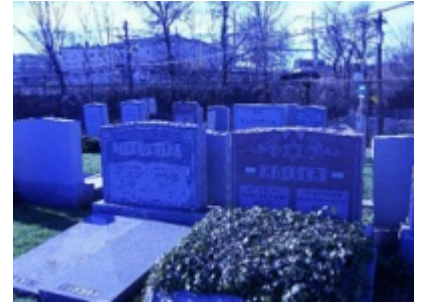
Gomel Chessed Cemetery

The observer who overheard this conversation related it to the FBI on numerous occasions only to be ignored each time. Nothing was done about it, and no investigation into the incident has ever taken place.