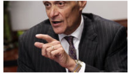
Michael Chertoff, Assistant Attorney General for the Criminal Division on 9/11