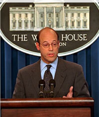
Ari Fleischer, White House Press Secretary on 9/11