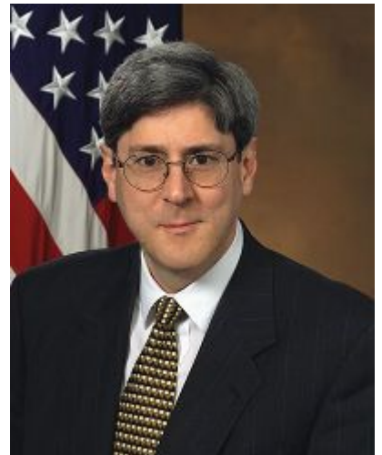
Douglas Feith, Under Secretary of Defense for Policy on 9/11